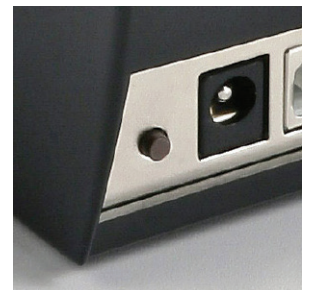
Innovative "C" button makes label Calibration simple and fast