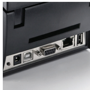
Ethernet, USB 2.0, Serial and USB host are standard features adding flexibility and power