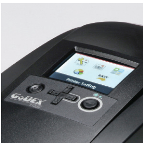
Color TFT LCD and operation panel for easy and intuitive operation

The RT200i barcode printer is packed with performance enhancing features that makes it the most powerful 2" thermal transfer printer