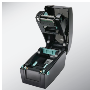
Modern clam-shell design makes it simple to load labels