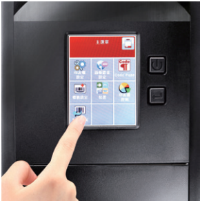
3.2" color LCD panel designed for ease of use

The world's most comprehensive compact 600 dpi desktop printer. The RT860i is a perfect companion to deliver fine quality printing at a superb value.