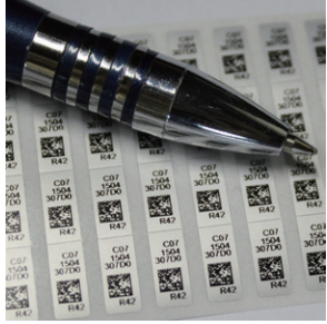
Micro print at 600 dpi resolution