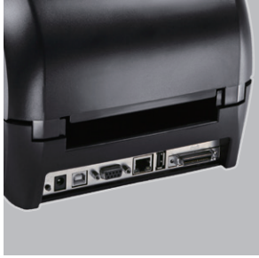
Ethernet, USB, Serial, and Parallel Ports Standard for easy integration