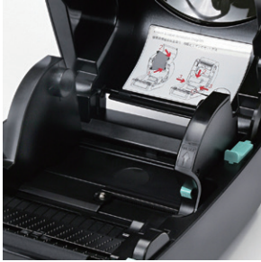
Drop-in label roll holder for easy media installation