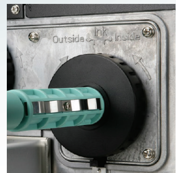
All metal, industrial enclosure and print mechanism