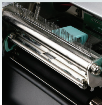
Easy to change, low-cost printhead assembly